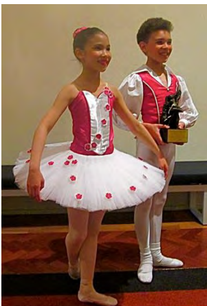
Winners of the 2015 Award